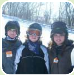
Teen Snowboard Trip -January-