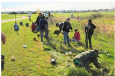
Volunteers gathered at Prairie Point Community Park in October to plant trees and perennials donated by the Park Foundation whose goal is to plant a grove of native trees leaving a legacy for future generations to enjoy.

The Oswegoland Park & Recreation Foundation was established in 2005 as a 501(c)(3) nonprofit corporation. It is a tax-exempt public foundation operating for the benefit of the Oswegoland community. Its board of directors is made up of citizens who operate independently of the Park District, yet in support of its mission.