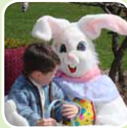
Lunch with the Bunny -March-