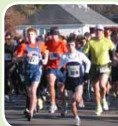
Gobbler Hobbler 10K -November-