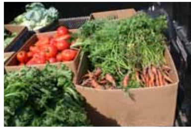
Fresh produce enroute to the Kendall County Food Pantry.

Pearce's Ford playground, the District's first fully accessible play structure was built in partnership with the Fox Valley Special Recreation Association. FVSR contributed $130,740 toward the poured rubberized surfacing making the equipment safe and great fun for all ages and abilities.