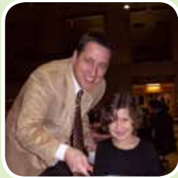
Daddy Dancing with the Stars -February-