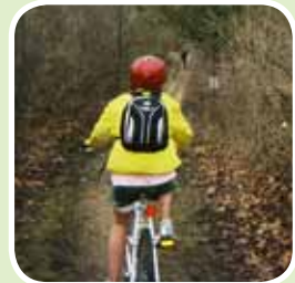
Big Mouth Adventure Race -April-