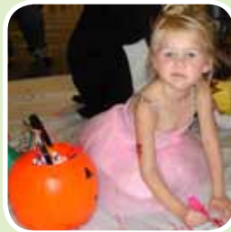
Monster Mash Bash -October-