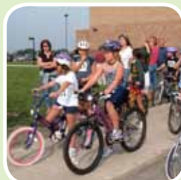
Kids' Triathlon -September-