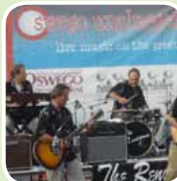
Concerts in the Park -July-