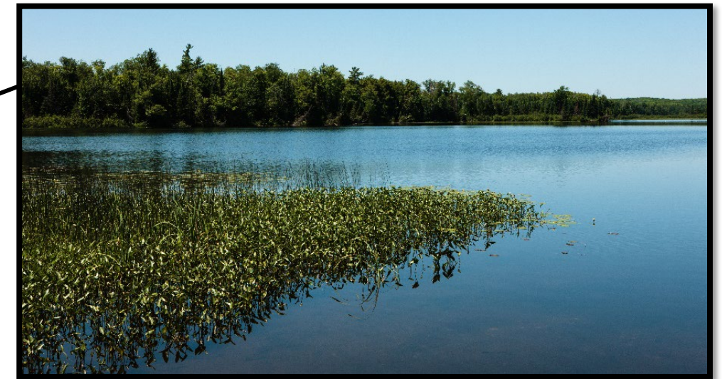
Aquatic Plantings Viability Test