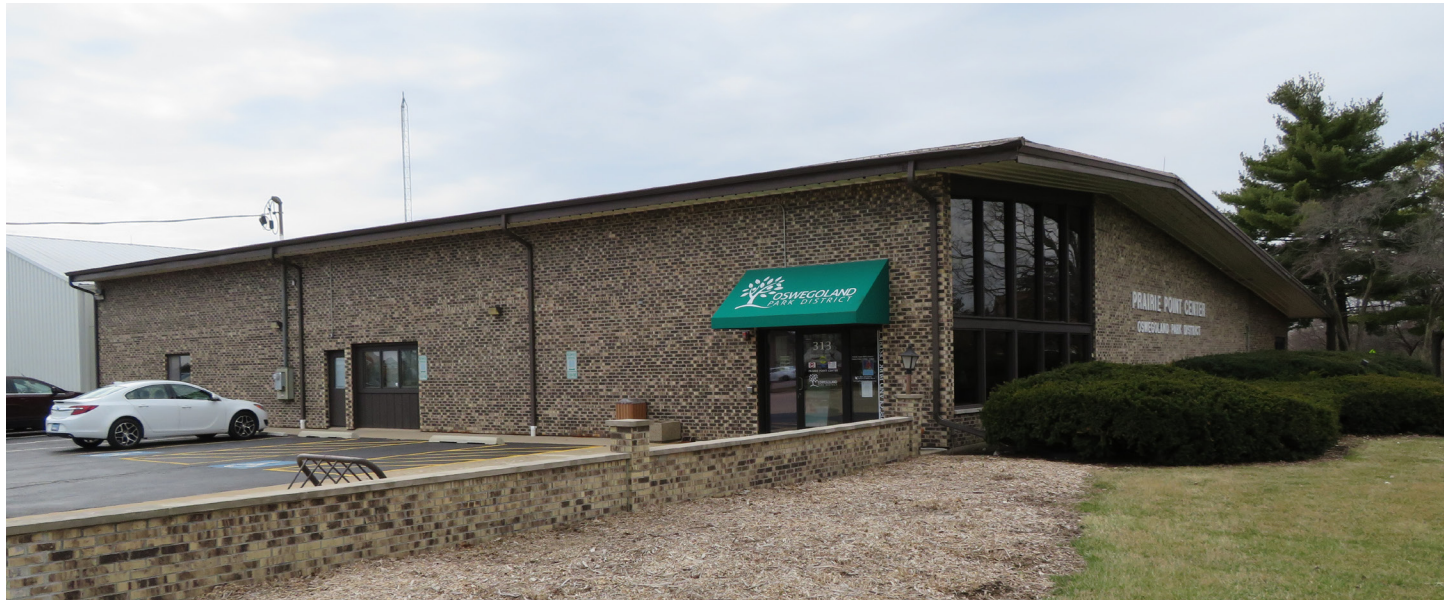
Prairie Point Center facade