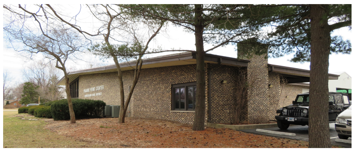
Prairie Point Center facade